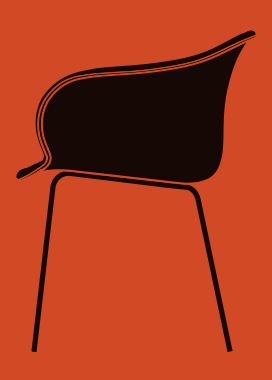
Elefy JH28 & JH29 by Jaime Hayon 2019