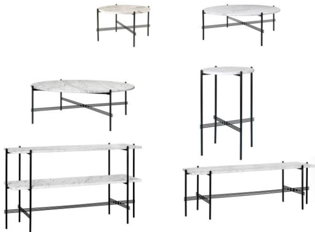
TABLE Ø55, TS TABLE Ø80, TS TABLE Ø105, TS TABLE ROUND CONSOLE CONSOLE, TS TABLE 1 CONSOLE.

part number in the pricelist. if the following: