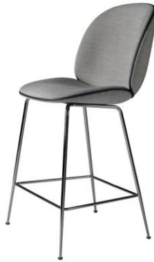
Beetle Counter Chair