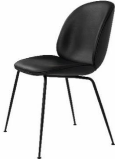
Beetle Dining Chair