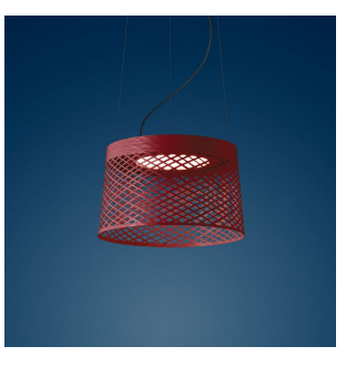
Twice as Twiggy Grid