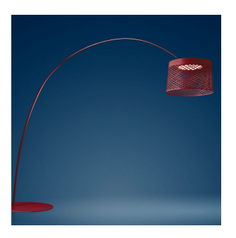
Twice as Twiggy Grid