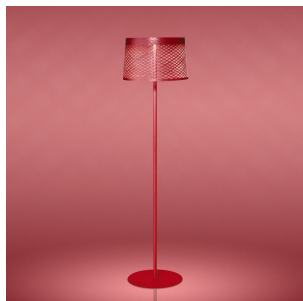
Twiggy Grid Lettura