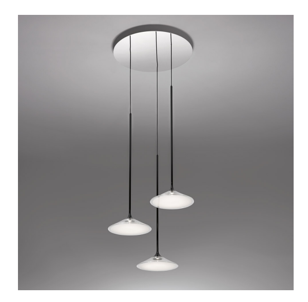
IP 20 ( € Dimmerable: +0 -