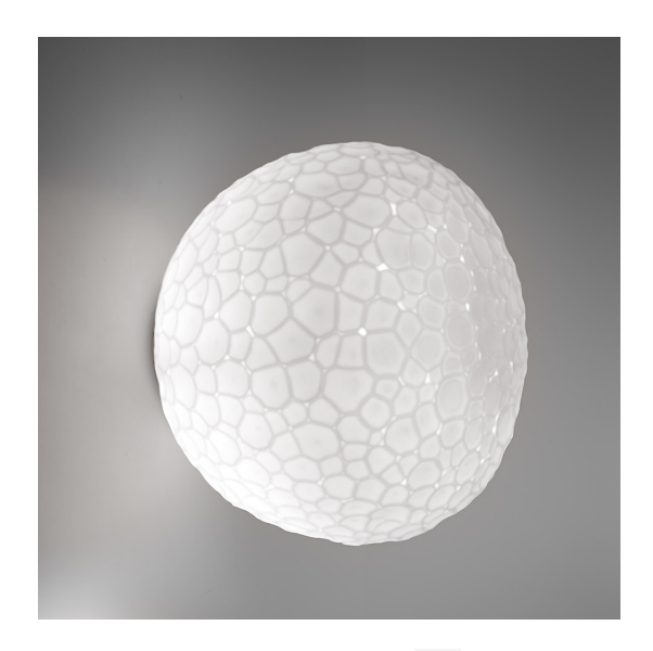
IP 20 ☐ 《 ( € Dimmerable: +① -