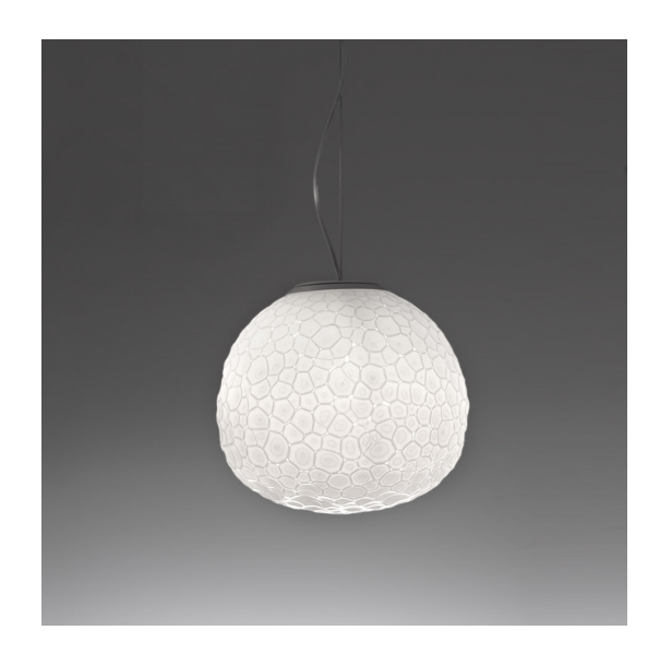
IP 20 ☐ 《 ( € Dimmerable: +① -