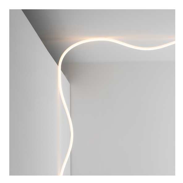
IP65 ( C € Dimmerable: +0-