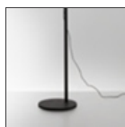
DEMETRA SUPPORTO F BCO 1741020A