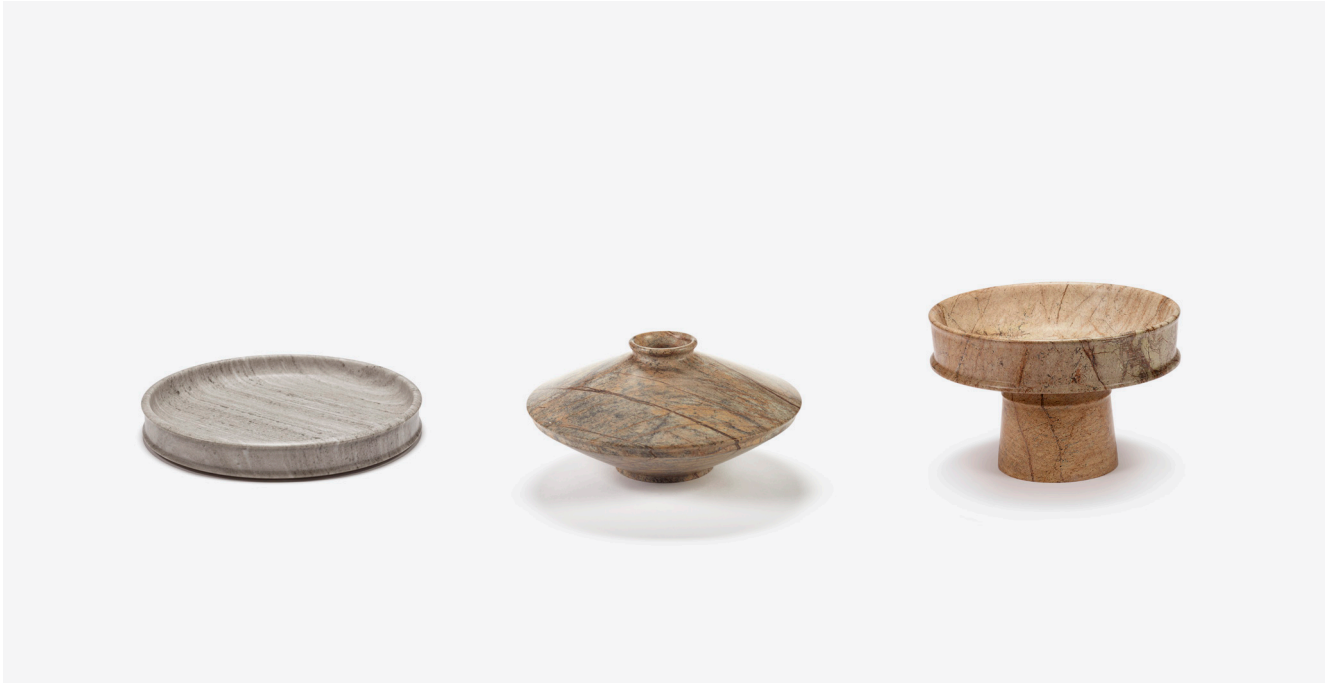
TABLE & KITCHEN ACCESSORIES