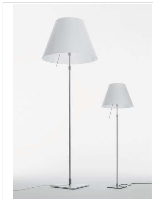
D13G t. - D13G t.i - D13G t.flu

Reference code: D13G t. 1D13GTDH0020 alu D13G t.i. 1D13GTIH0020 alu D13G t.flu. 1D13GTIL0020 alu